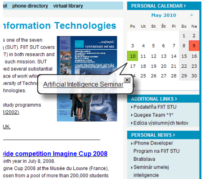
Figure 3. Calendar (shows recommended event on 10/05/2010), additional links and personal news sections.

We monitor the portal and capture every change in text of a web page (this could be for example a change in time and place of some event). Every changed page is marked as news and added to a special news section. We also recommend other potentially interesting links which are neither events nor news . Figure 3 shows part of a web page enhanced with personalized sections.