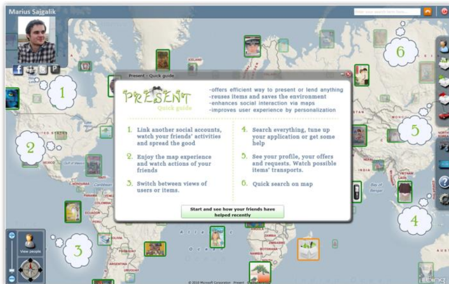
Fig. 3. Present – introduction screen.

In order to evaluate our approach to intelligent information visualization, we developed a web-based system called Present, which aims to help preventing precious nature resources by supporting re-use of ordinary goods and items instead of their endless production (see Figure 3). This is done by providing people with efficient means for donating or lending items, which are functional, but not used any more, and on the other side for requesting such donations or lendings.