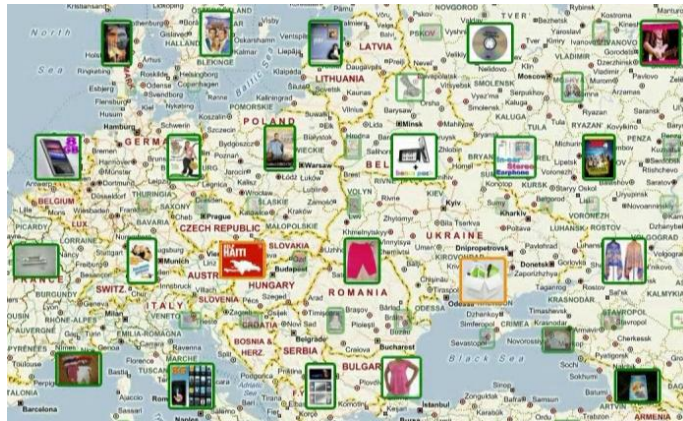
Fig. 2. Personalized visualization of IntelliView.

problems on neighboring cell's bounds. As a positive side effect, due to uniform distribution of items on the map, this view is symmetric and more readable, but it may appear a bit artificial because of that. Finally, we abandoned this method due to its unattractiveness for users.