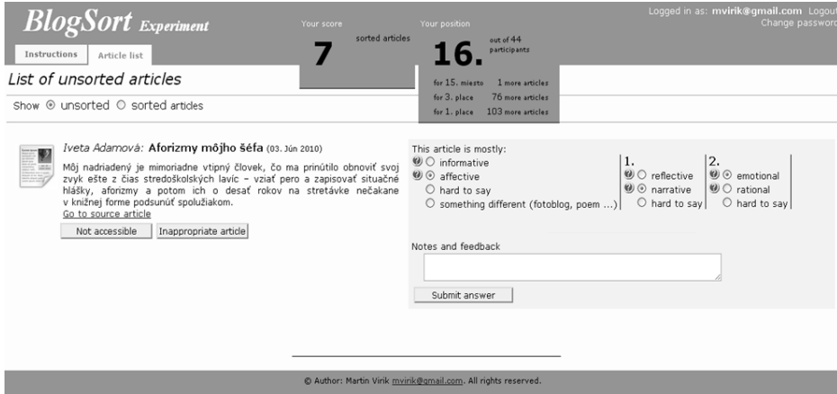
Figure 1. BlogSort web application screenshot. After reading a blog post, a user can decide whether it is informative or affective (bottom-right). The other two columns (for affective dichotomies) appear only after the user selects affective option. To cover the case when the user is uncertain there is always a hard to say option in every column. To filter out non-classifiable posts there is a something different option in the first column. There was also a motivational factor featured in the application: a score based on number of sorted blog articles by a user was visible to him/her. The presented blog content (left) is in Slovak language.

All the blogs were labelled by several human annotators. In line with our motivation to facilitate navigation of web users in blogosphere (e.g., looking up for blog posts that match their preferences), we employed ordinary web users as annotators. Our aim was to provide independent writing style labels from the proposed classification space and assembly a sufficiently large dataset. To meet this goal, we created BlogSort – a web application allowing participants to read the blog post and decide, whether it is informative or affective. In case of affective blog post they were able to classify it into two other dichotomies. We put stress on gathering the most accurate labels. We did not force the participants to classify the blog if they did not want to do so or if they did not know to select the proper class. The participants had to choose the dominant class, otherwise they could choose hard to say option, indicating that it is not possible to decide what the dominant style is. Our aim was to reduce random labels provided by participants at the most and minimize the unwanted noise in the dataset. Figure 1 presents a screenshot of the BlogSort application showing the main user interface.